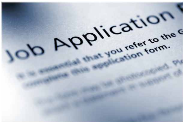
If you have a criminal record, and you are asked a question about it, you must be truthful.

The Equal Employment Opportunity Commission (EEOC), a federal agency, has taken the position that employers who, by policy or practice, automatically exclude people from employment on the basis of an arrest or criminal record are in violation of Title VII of the Civil Rights Act of 1964. Denying employment on the basis of an arrest or conviction record has an adverse impact on Blacks and Hispanics, because they are convicted in greater numbers than Whites and other nationalities.